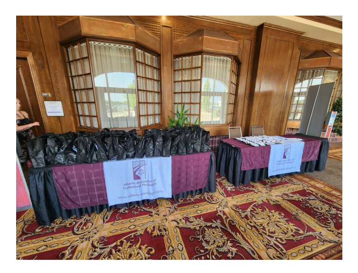
Thank you to our sponsors for contributing items for our swag bags!!