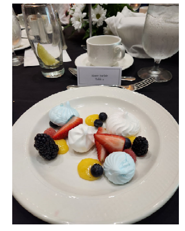
Dinner and Dessert—perfect for an Awards Gala