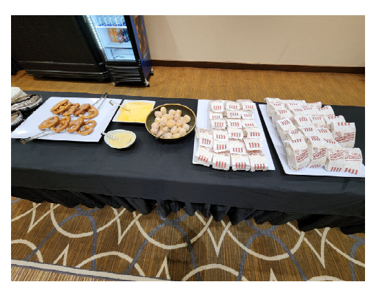
Snacks after breakout sessions were a must!!