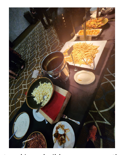
Networking—build your own poutine