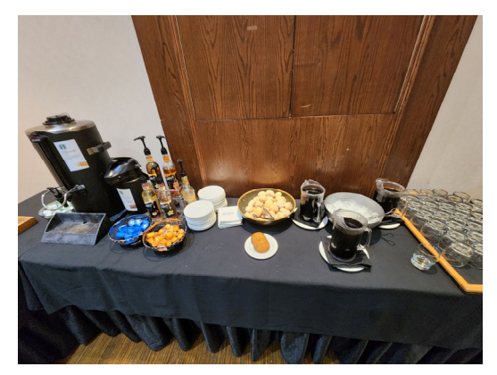
Coffee stations-fuel for legal support professionals